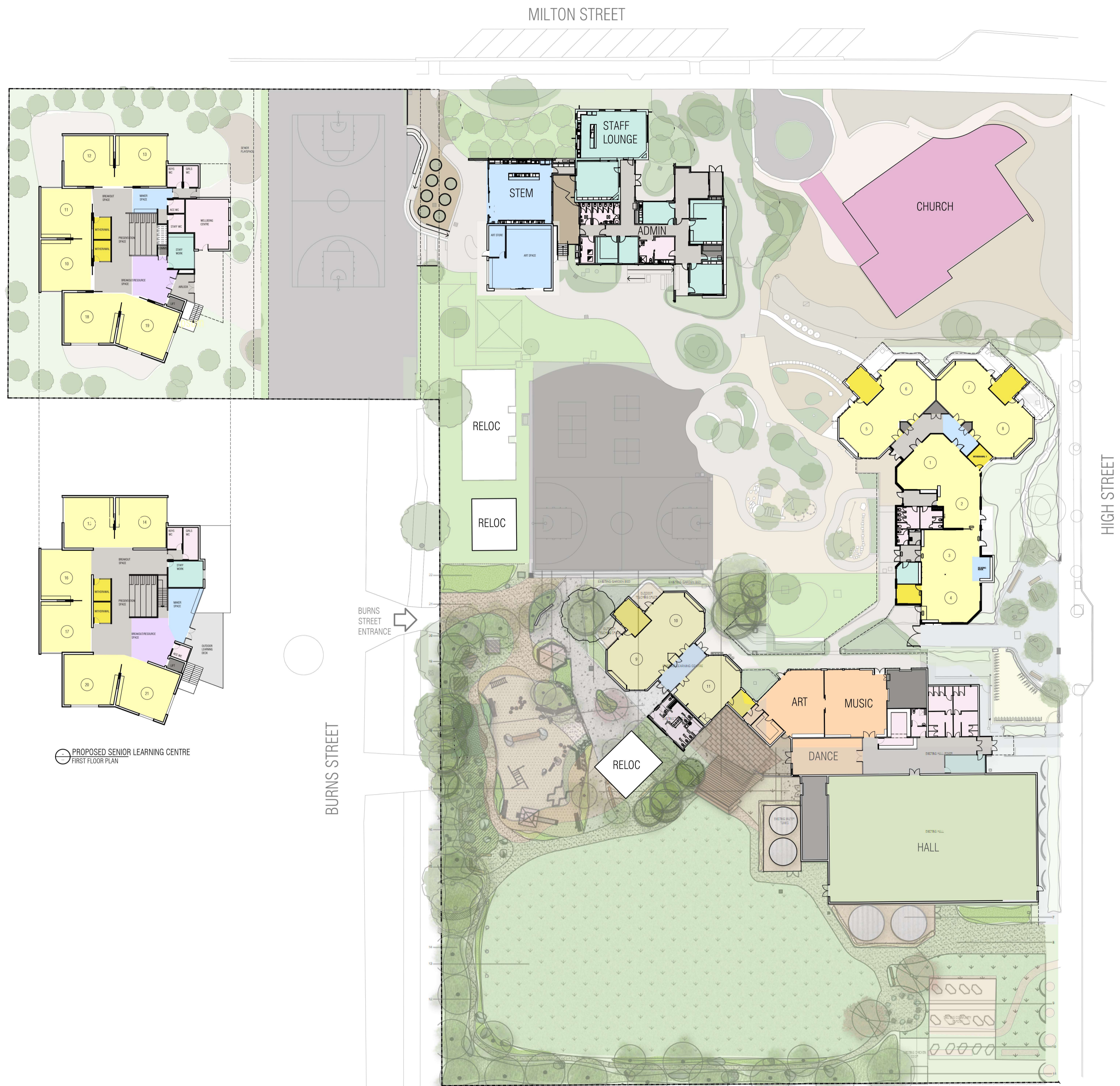
⊕ PROPOSED SENIOR LEARNING CENTRE FIRST FLOOR PLAN